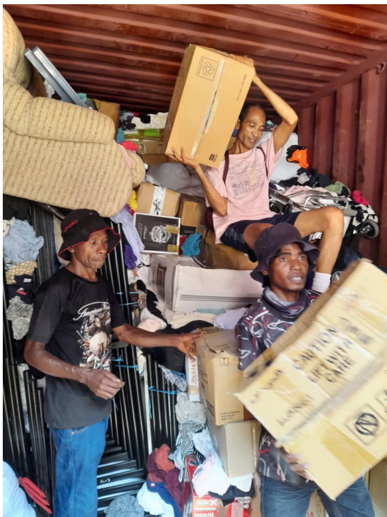
Unloading a container

The packing crew consists of volunteer Rotarians, members of the Timorese community and other committed volunteers from the WA community.