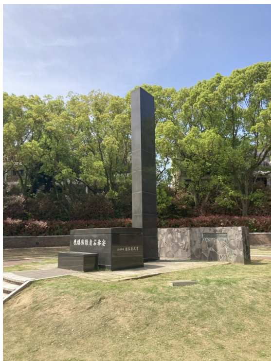
Nagasaki Hypocentre Cenotaph