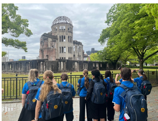
Atomic Bomb Dome Hiroshima