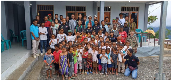
Students, staff and community members in front of the newly opened Ponilala Pre-School