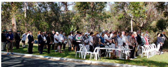
Lovekin Drive, Kings Park, 3pm, Sunday 17 November 2019

https://www.rslwa.org.au/news/rslwa-invites-aussies-to-embrace-the-spirit-of-mateship-this-anzac-day/ . Similar arrangements are being promoted by the RSL branches in other states.