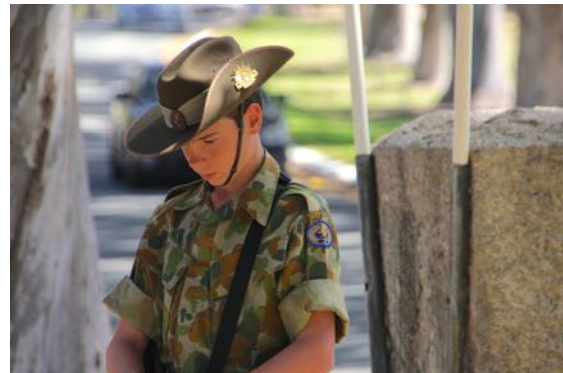
Member of the catafalque party, a cadet of 53 Army Cadet Unit, Wanneroo

Thank you to those that joined us on the day either in person or online. Numbers were up which was great to see! The ceremony is available for playback here: https://courier.doublereds.org.au/ceremony2016