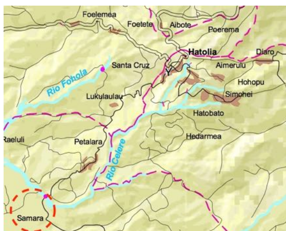
Map showing the location of Samara-Casbouk Schools – bottom left hand corner

The villages lie close together in a remote area to the southwest of Hatolia and have 600-700 students. 12 teachers will be trained.