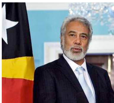
Above: His Excellency Xanana Gusmão, Timor-Leste's minister of planning and strategic investment

At 6pm on Monday 20 April 2015, there will be a sunset commemorative ceremony at our Lovekin Drive memorial, to coincide with a visit of East Timorese veterans around Anzac Day.