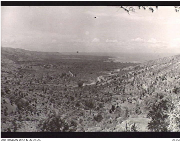
Fatuai [Darlau], Portuguese Timor. 1946-01-09. The Baiwro China Valley showing the districts of Taibessi and Dili. [2]