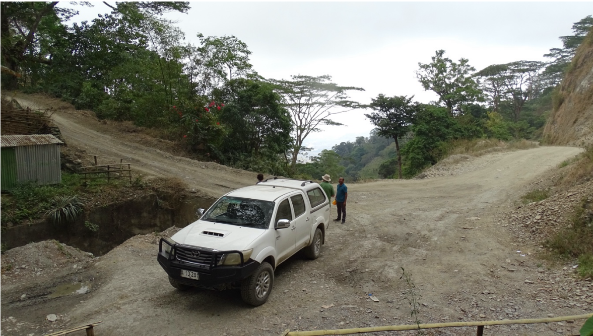
Singapore Tiger ambush site – 5 August 2022