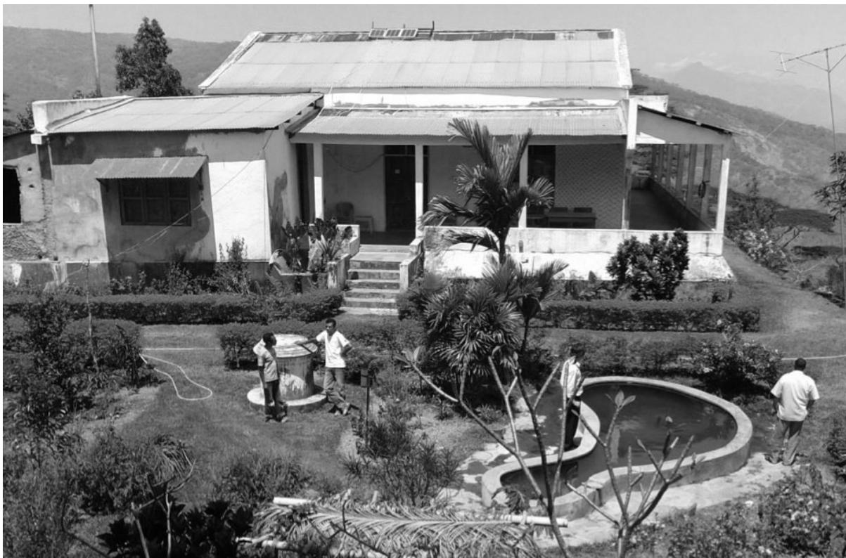
The house and gardens of the historical farm of Fazenda Algarve ... [3]

Fazenda Algarve (-8.6708,125.3298, 916m, accuracy: 20m): Located at the house of Carrascalão near Darulete. The caretaker showed the site of the old weather station in Portuguese times and a wind run gauge was also found installed during Indonesian times. Fazenda Algarve was originally known as Granja Eduardo Marques, founded in 1908 employing 5,000 indigenous labourers. [2]