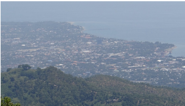
Dili from the Darlau OP - 26 April 2014