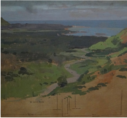
Charles Bush 'Panorama of Dili area' 1945 The scene of many of the operations of 2/2nd Australian Independent Company in their guerilla warfare against the Japanese in Timor during the Japanese occupation of the island. [1]