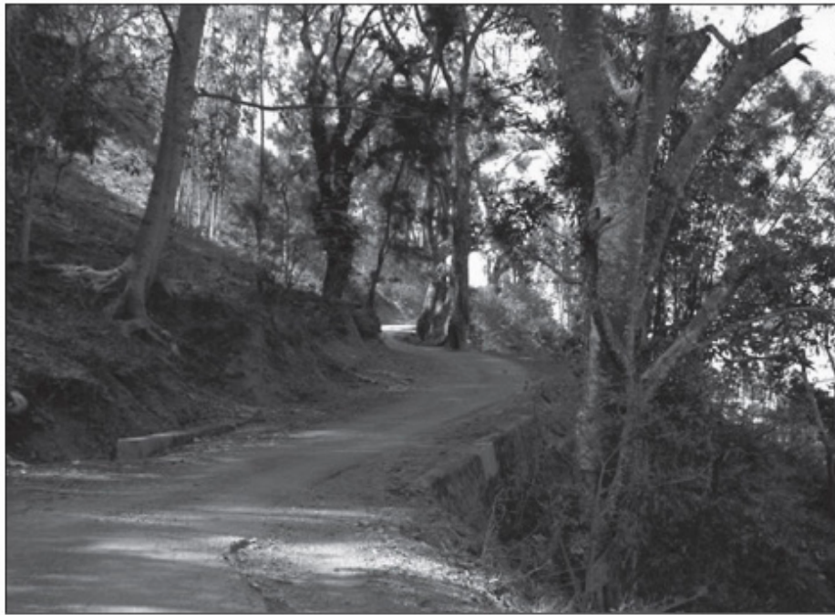
Recent photo of the location of Remexio ambush, May 1942, from the vantage point of the six Australians [3]