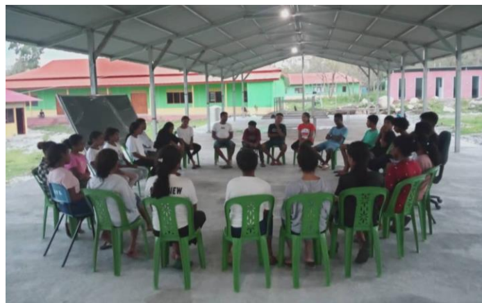
Full Time students joining a briefing from the teachers