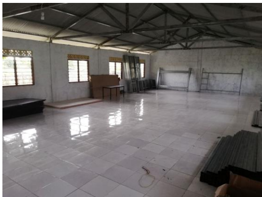
Starting with an empty dorm

The AHHA team travelled by our trucks to Same. We transported all the bed frames, tables and other equipment. We also took 6 of the full time students with us and began our educational journey together. In the evening the team met the registration team on site and assembled the first beds to test site tools, experience the assembly process and make any adjustments. The tables are assembled by drilling and rivet nailing. The beds require welding of all the cross beams before the plywood is fitted with screws.