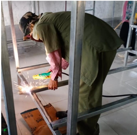
Welding the beams