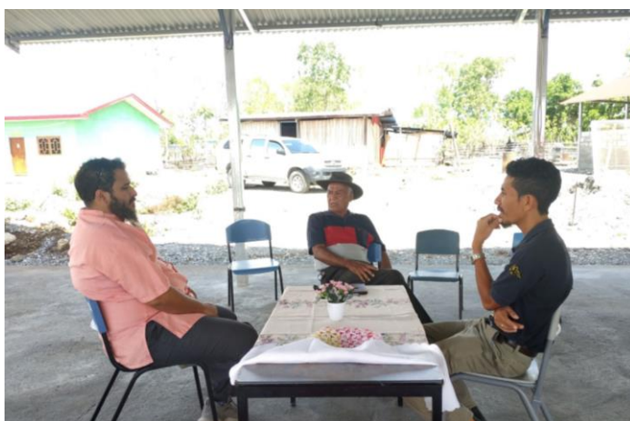
Keys handover ceremony on behalf of VCA.