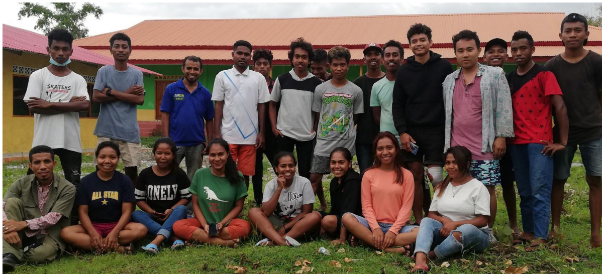
Team Photo after working - AHHA Teachers with Full Time Students from Veterans Training Centre and AHHA Same District Centre