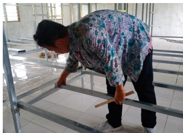
Connecting the beams of the beds