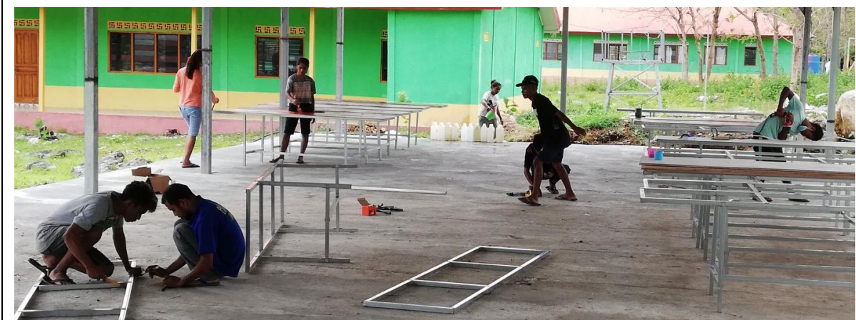
Teachers and students worked together.