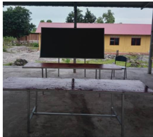
Big Hall Classroom with Blackboard