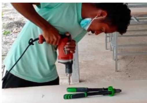
Drilling the plywood to the table frame