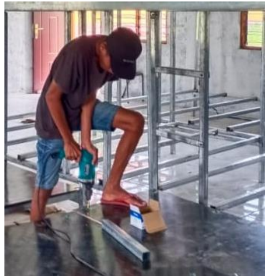
Screwing the plywood to the bed frames