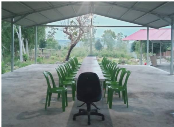
Dining Area with 2 tables