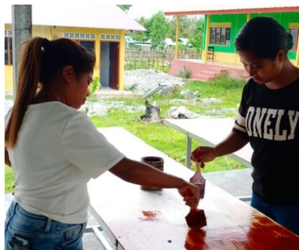
Painting the varnish on the tables