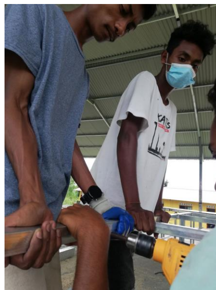
Students working together to assemble tables. Drilling holes for rivet nailing.