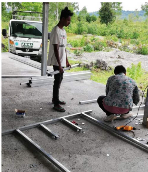
Assembling a staircase on the bed frame. A new student with a volunteer from Laos.