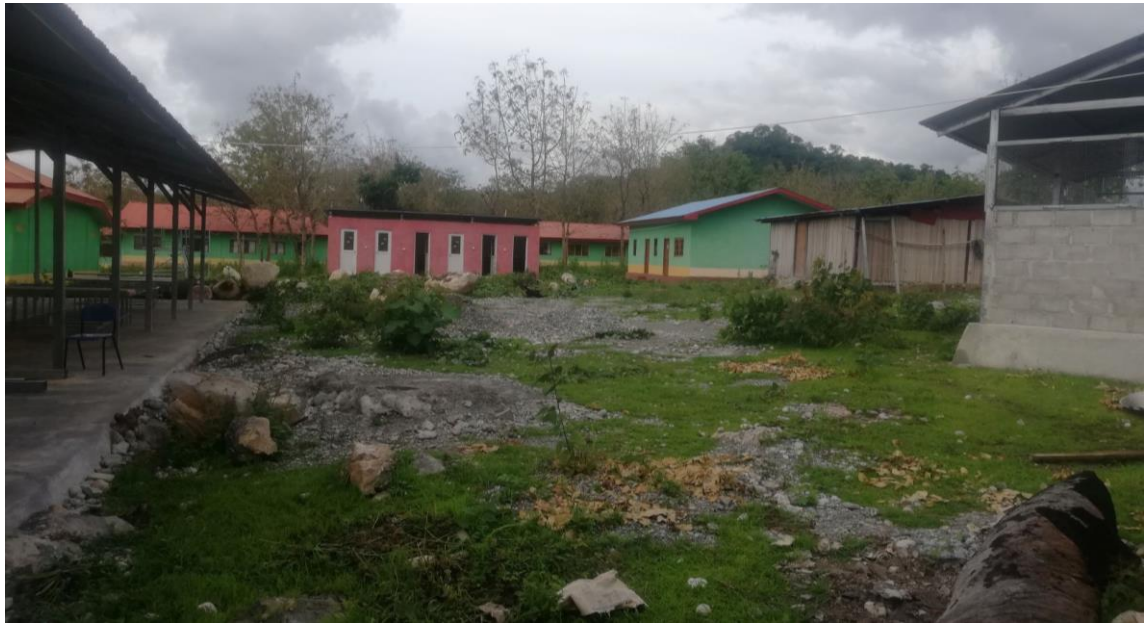
The land with left over materials before cleaning starts