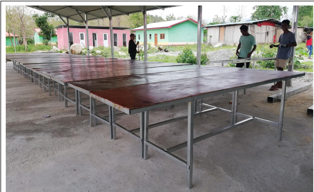
20 tables were assembled on site.

We designed and assembled 20 classroom tables from iron and varnished plywood. Each table can accommodate 4-6 students in a line or 8-10 students in a roundtable arrangement.