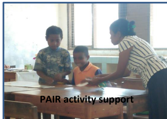
PAIR activity support