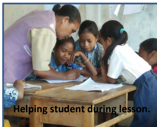
Helping student during lesson.