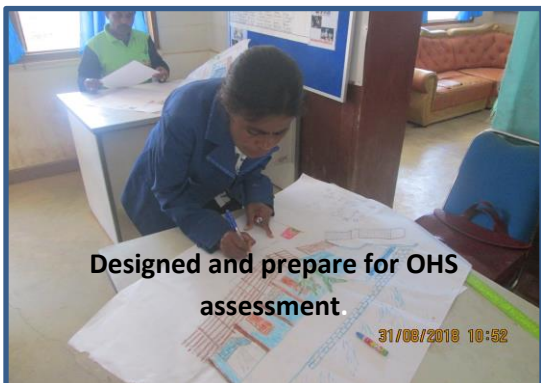
Designed and prepare for OHS assessment.