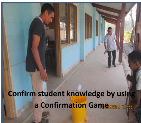
Confirm student knowledge by using a Confirmation Game