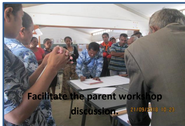
Facilitate the parent workshop discussion.