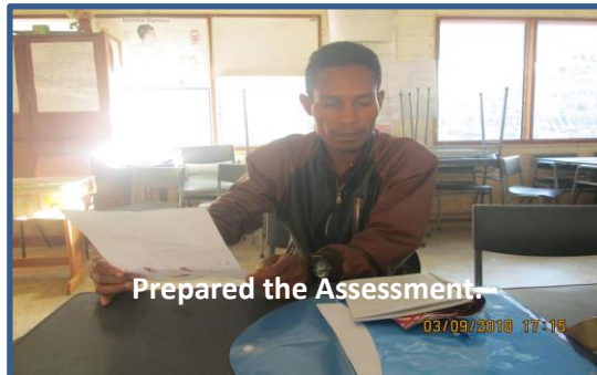
Prepared the Assessment