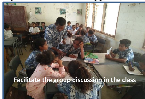
Facilitate the group discussion in the class

thank you to SDRA team who has facilitated us to understand and use the curriculum for the implementation in our learning process.