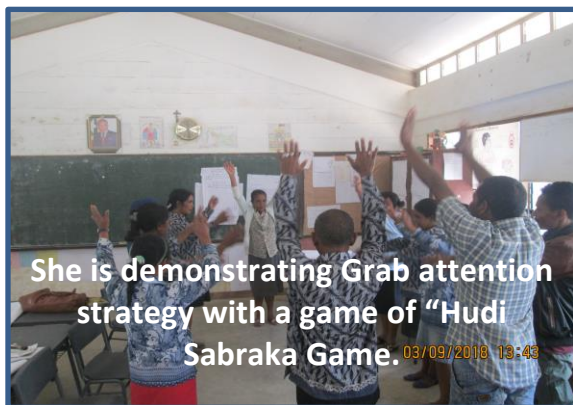
She is demonstrating Grab attention strategy with a game of "Hudi Sabraka Game." 03/09/2018 13:43