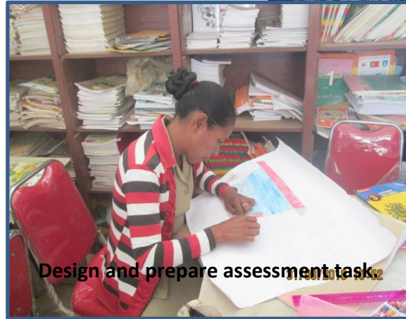
Design and prepare assessment task