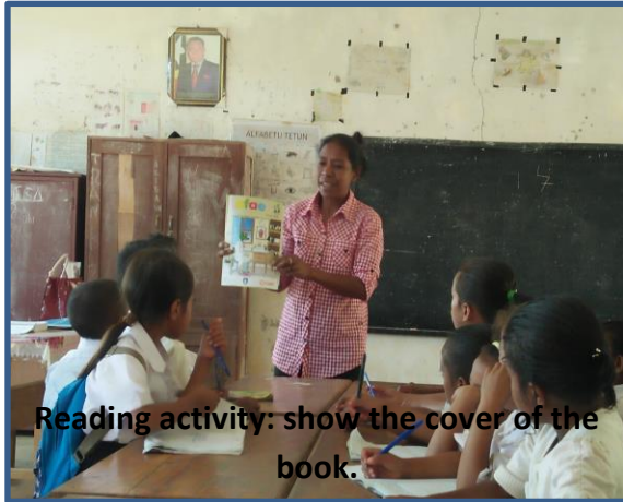
Reading activity: show the cover of the book.