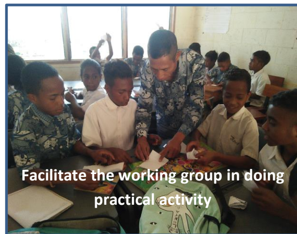
Facilitate the working group in doing practical activity