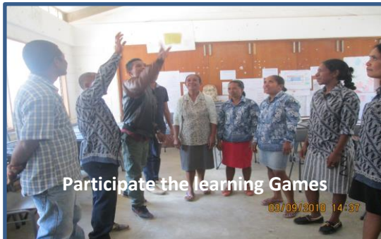
Participate the learning Games