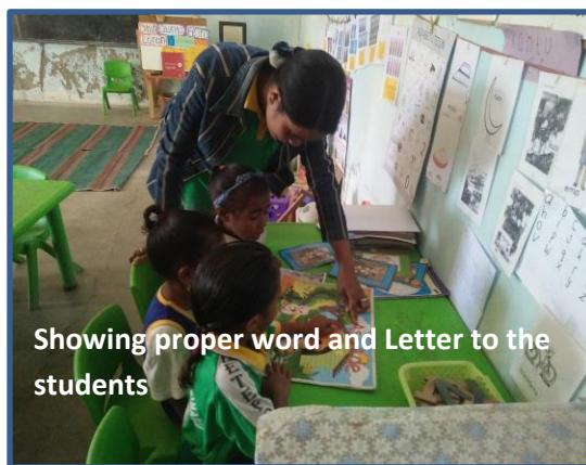
Showing proper word and Letter to the students