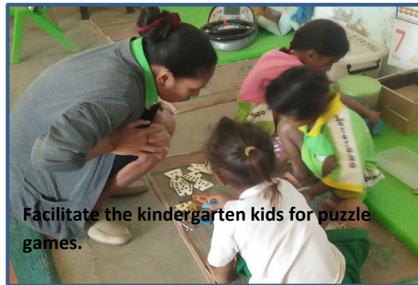
Facilitate the kindergarten kids for puzzle games.