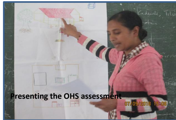
Presenting the OHS assessment