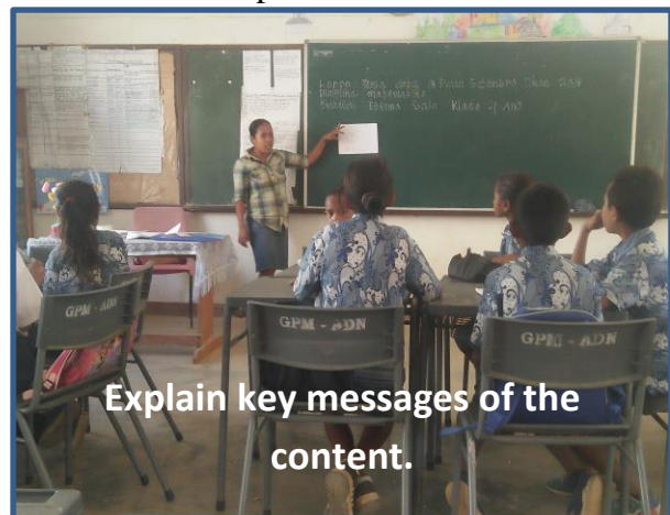
Explain key messages of the content.